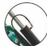
3. Heavy Long Cylinder