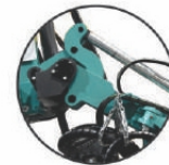
1. Single Pin Dump Shaft