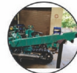
2. Square Type Boom Bare